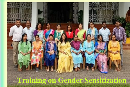
Training on Gender Sensitization