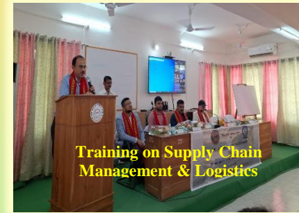
Training on Supply Chain Management & Logistics