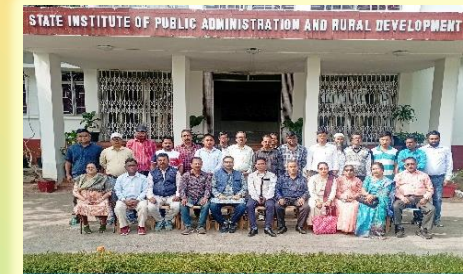
Title: Climate Smart Villages Organized by: SIPARD, Agartala