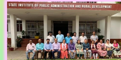
Training on "Mentoring Skills" Sponsored by- DoPT, Govt. of India