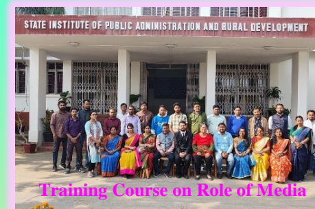
Training Course on Role of Media