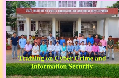
Training on Cyber Crime and Information Security