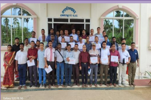
Social Defense Issues for Panchayati Raj Functionaries for Gomati District from 22 nd to 24 th October, 2024 at PRTI, Udaipur