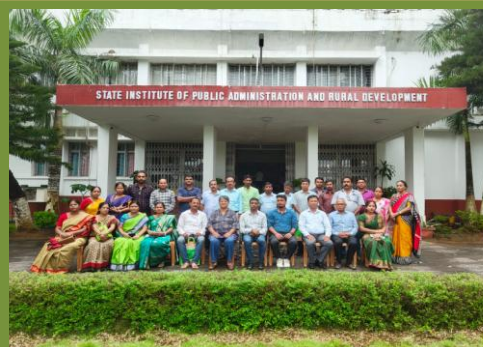
Social Defense Issues for Panchayati Raj Functionaries for Sepahijala District from 3 rd to 5 th October 2024 at SIPARD, Agartala