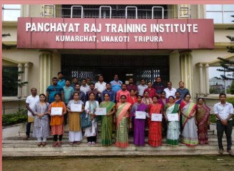
Social Defense Issues for Panchayati Raj Functionaries for North District from 3 rd -5 th October, 2024 at PRTI, Kumarghat

The three-day training programmes served as a valuable platform for imparting in-depth knowledge and information on the respective topics. On the final day, participants provided feedback and shared their insights, reflecting on the relevance of the sessions and their practical applications. They expressed keen interest in supporting and participating in similar initiatives in the [Type a quote