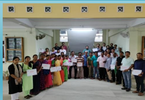
Social Defense for Panchayati Raj Functionaries for Dhalai District from 22 nd to 24 th October, 2024 at PRTI, Ambassa