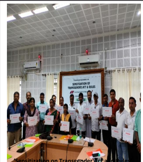
Sensitization on Transgender Act and Rules from 29 th to 31 st October 2024 at Unakoti Circuit House, Kailashahar