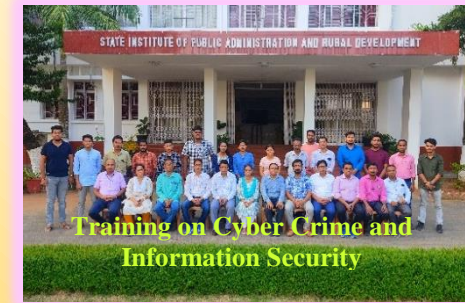
Training on Cyber Crime and Information Security