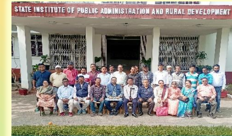
Title: Climate Smart Villages Organized by: SIPARD, Agartala