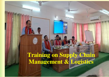
Training on Supply Chain Management & Logistics